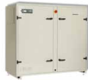
Swimming pool ventilation