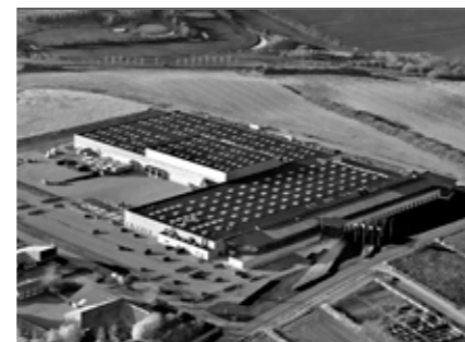
Dantherm headquarters in Skive, Denmark