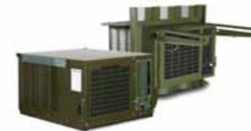
Air conditioner for containers