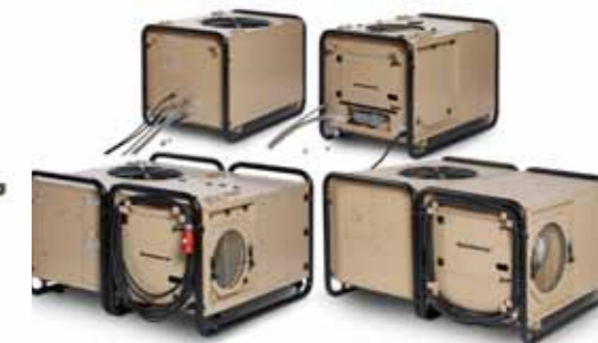
Mobile air conditioner