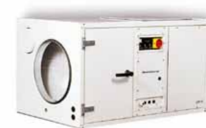
Pool dehumidifier, ducted