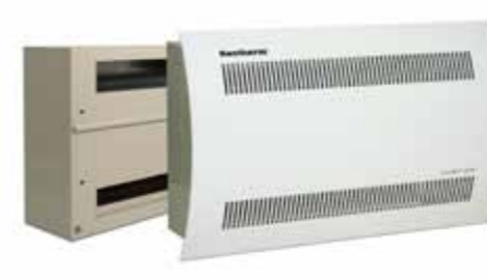
Pool dehumidifier, wall mounted